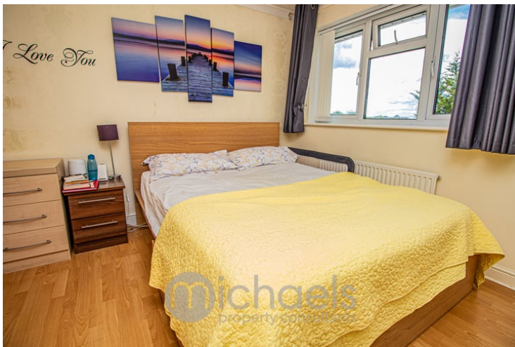
11' 2" x 9' 1" (3.40m x 2.77m)