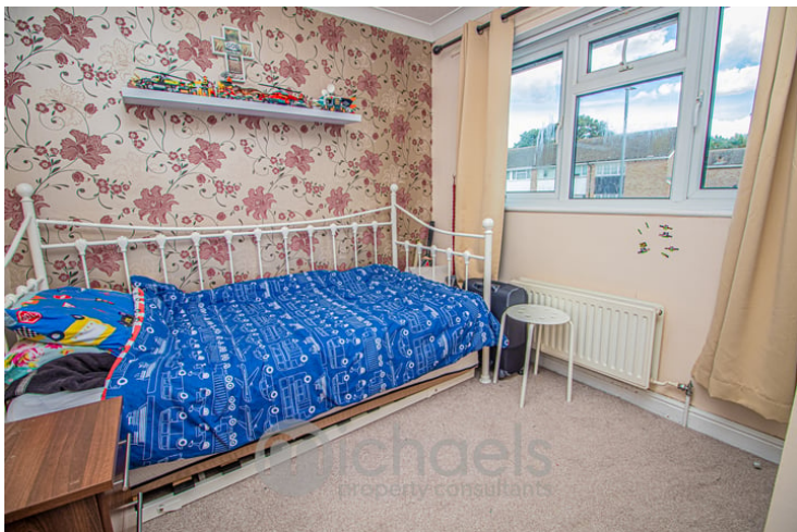
9' 5" x 8' 1" (2.87m x 2.46m)