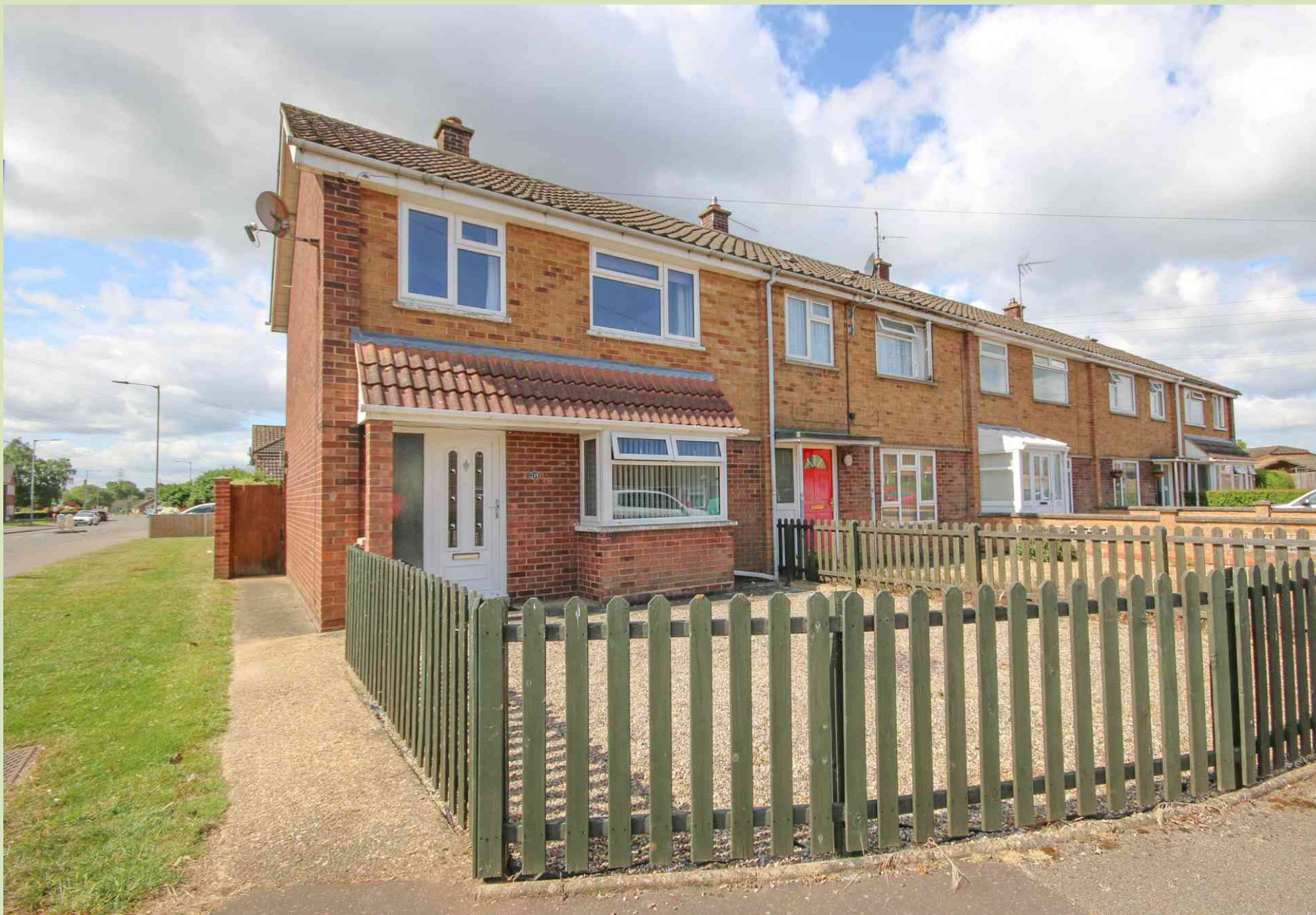
119 Columbia Way, King's Lynn Guide Price £189,950