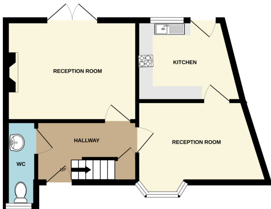
GROUND FLOOR 385 sq.ft. (35.7 sq.m.) approx.