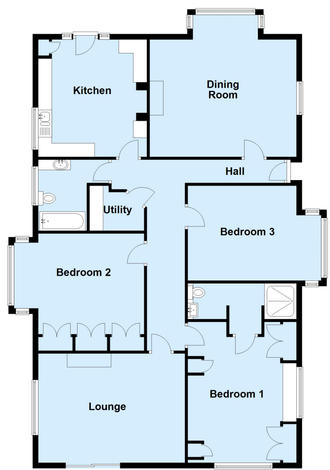
Total area: approx. 152.9 sq. metres (1646.2 sq. feet) This plan is for general layout guidance and may not be to scale. Plan produced using PlanUp.

Approx. 152.9 sq. metres (1646.2 sq. feet