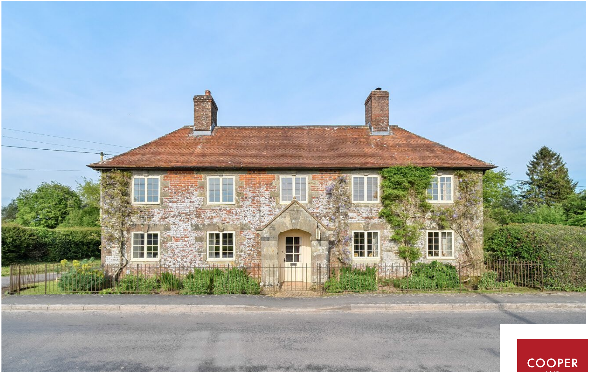
The Old Hunting Lodge, Stourton Lane, Stourton, Warminster, Wiltshire, BA12 6QN