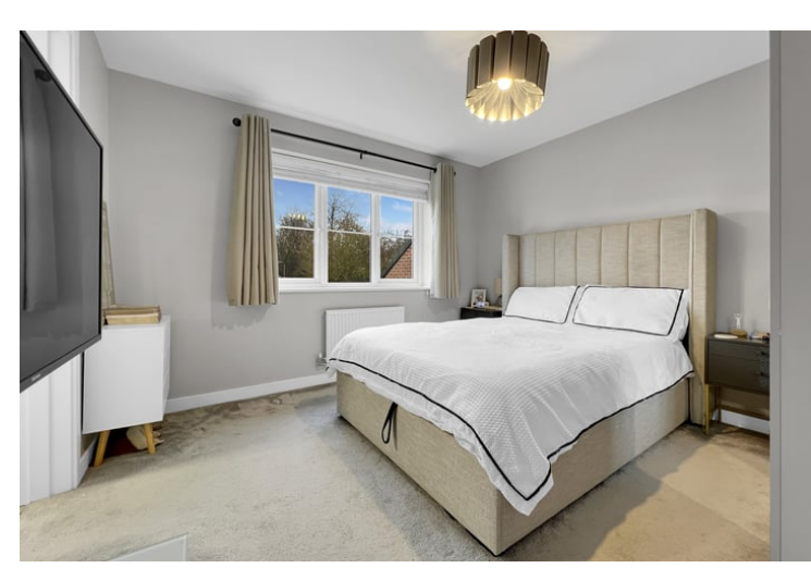
10'11" x 10' 10" (3.33m x