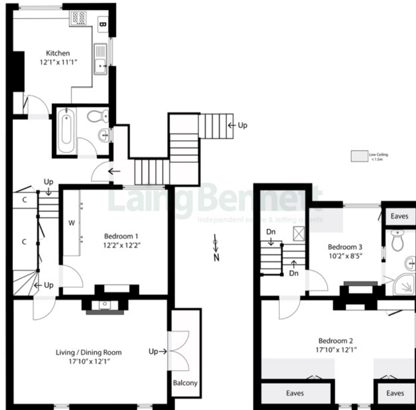
Illustration for identification purposes only. Measurements are approximate. Dimensions given are between the widest points. Not to scale. Outbuildings are not shown in actual location.

Approximate Gross Internal Area (Excluding Balcony & Stepped Access, Including Eaves) = 102 sq m / 1095 sq ft