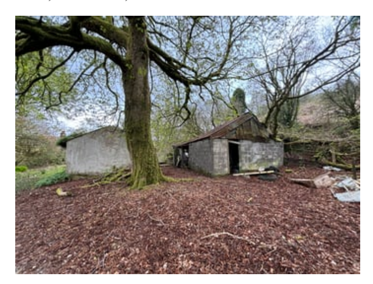
OUTHOUSES (SECOND IMAGE)

There lies a range of dilapidated outhouses/workshops to the front of the property offering potential for further workshop, studio, home office, etc.