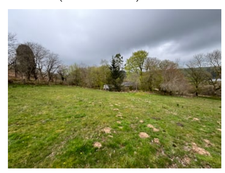
THE LAND (THIRD IMAGE)