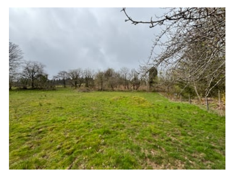
THE LAND (SECOND IMAGE)

In all the property extends to approximately 0.795 acres and to the rear lies a small paddock which is fenced and being gently sloping and offers potential for Animal keeping.