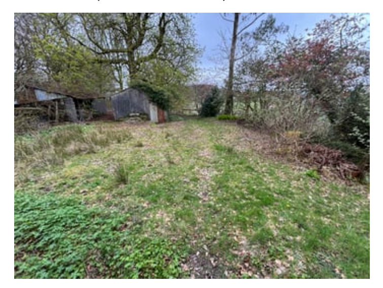
GARDENS (THIRD IMAGE)