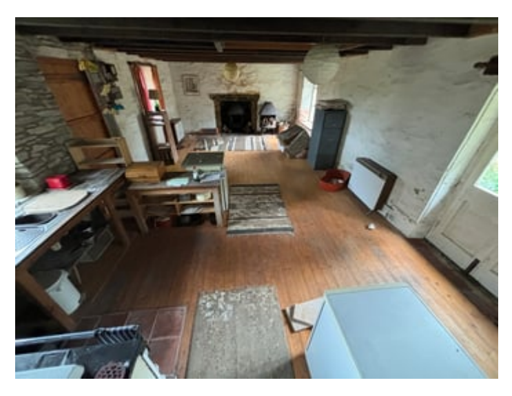
LIVING ROOM (SECOND IMAGE)

26' 5" x 14' 7" (8.05m x 4.45m). With solid wooden flooring, wood burning stove, feature ceiling beams, front exterior entrance door, electric storage heater, solid fuel cooking range, 1 1/2 sink and drainer unit.