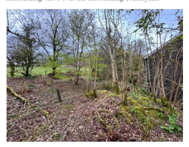
GARDENS (SECOND IMAGE)

Surrounding the property are mature and well established gardens with an abundance of mature shrubs and trees. Although currently in need of some clearance it offers great outside space, being totally private whilst enjoying mesmerising views over the surrounding countryside.