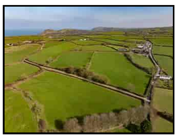
(Lot 1) Land at Morfa Uchaf, Llangrannog, Ceredigion. SA44 6RU.