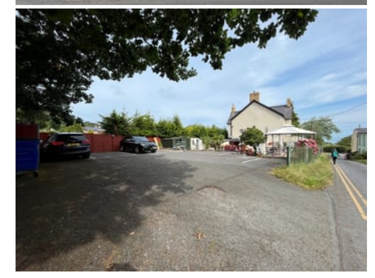
Side Area Laid to lawn with covered patio area