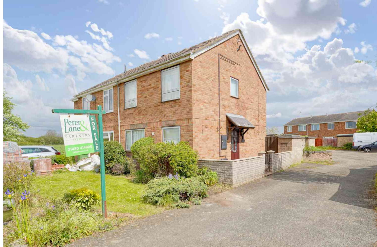
Dunholt Way, Colne PE28 3NW