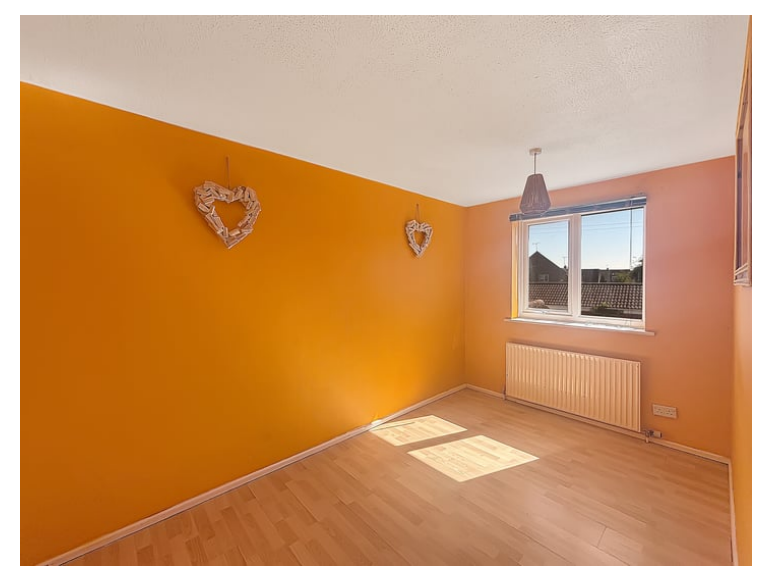
12'04" x 7'06" (3.76m x 2.29m) Double glazed window to rear, radiator.