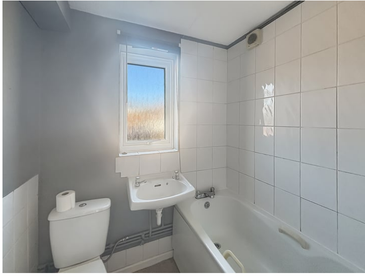
Double glazed obscure window to front, radiator, tiled walls, low level WC, wash hand basin, paneled bath with over head shower.