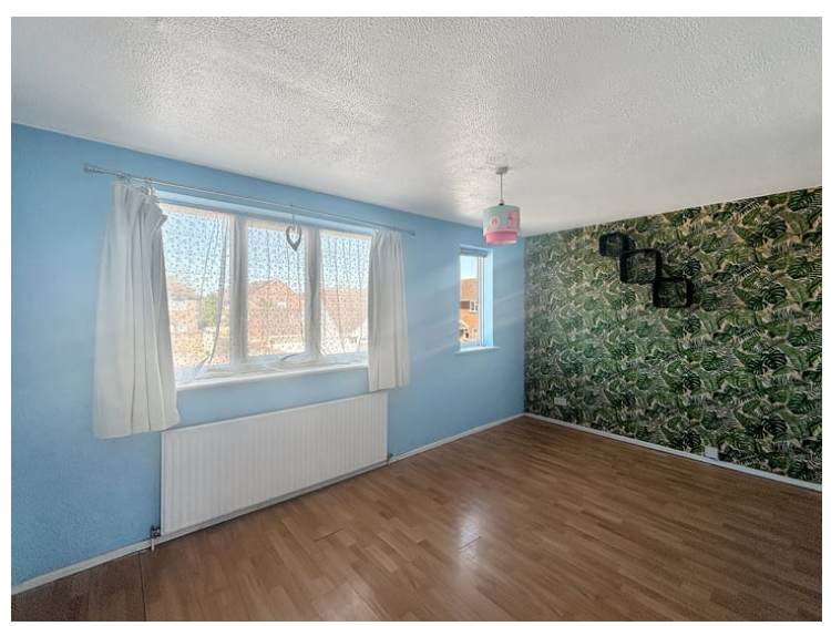
14' 07" x 9' 01" (4.45m x 2.77m) Double glazed window to front, radiator, storage cupboard. wardrobe.