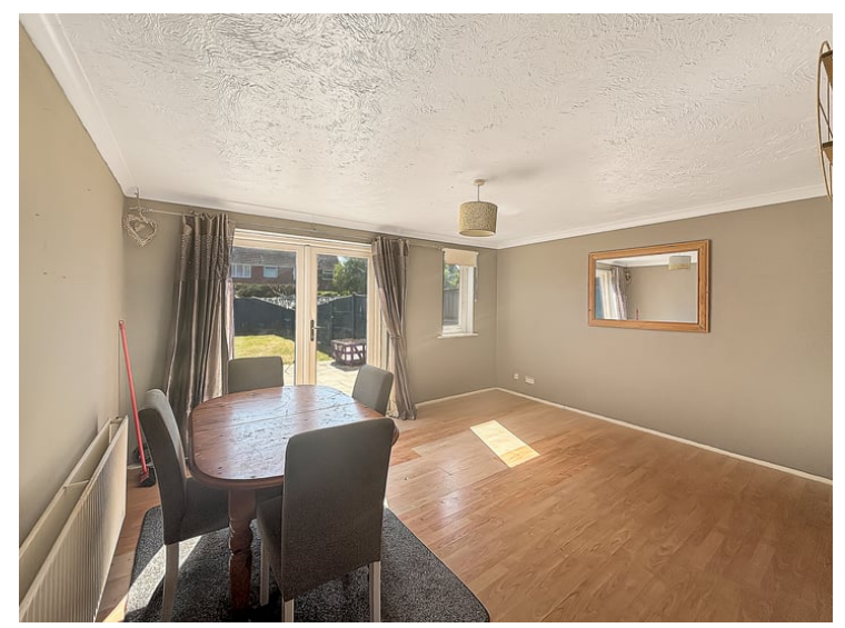
14' 06" x 12' 01" (4.42m x 3.68m) Double glazed French doors to rear and radiator.