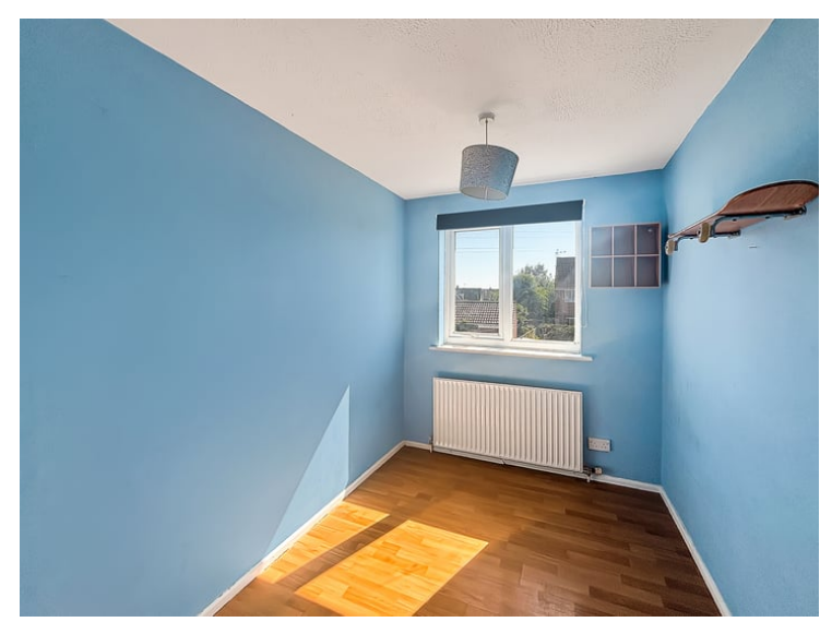
9' 02" x 6' 11" (2.79m x 2.11m) Double glazed window to rear, radiator. Outside