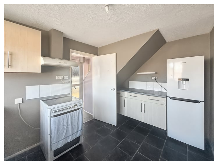
12'04" x 8'04" (3.76m x 2.54m) Double glazed window to front, fitted kitchen including a range of base units/draws and wall units, laminate worktop, stainless steel sink with left hand draining board, space for oven washing machine, fridge/freezer.