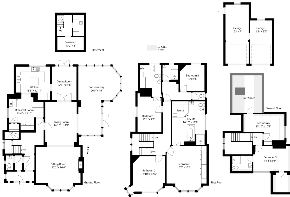
Illustration for identification purposes only. Measurements are approximate. Dimensions given are between the widest points. Not to scale. Outbuildings are not shown in actual location.

Approximate Gross Internal Area (Including Low Ceiling, excluding loft) = 324 sq m / 3487sq ft Garage = 32 sq m / 348 sq ft