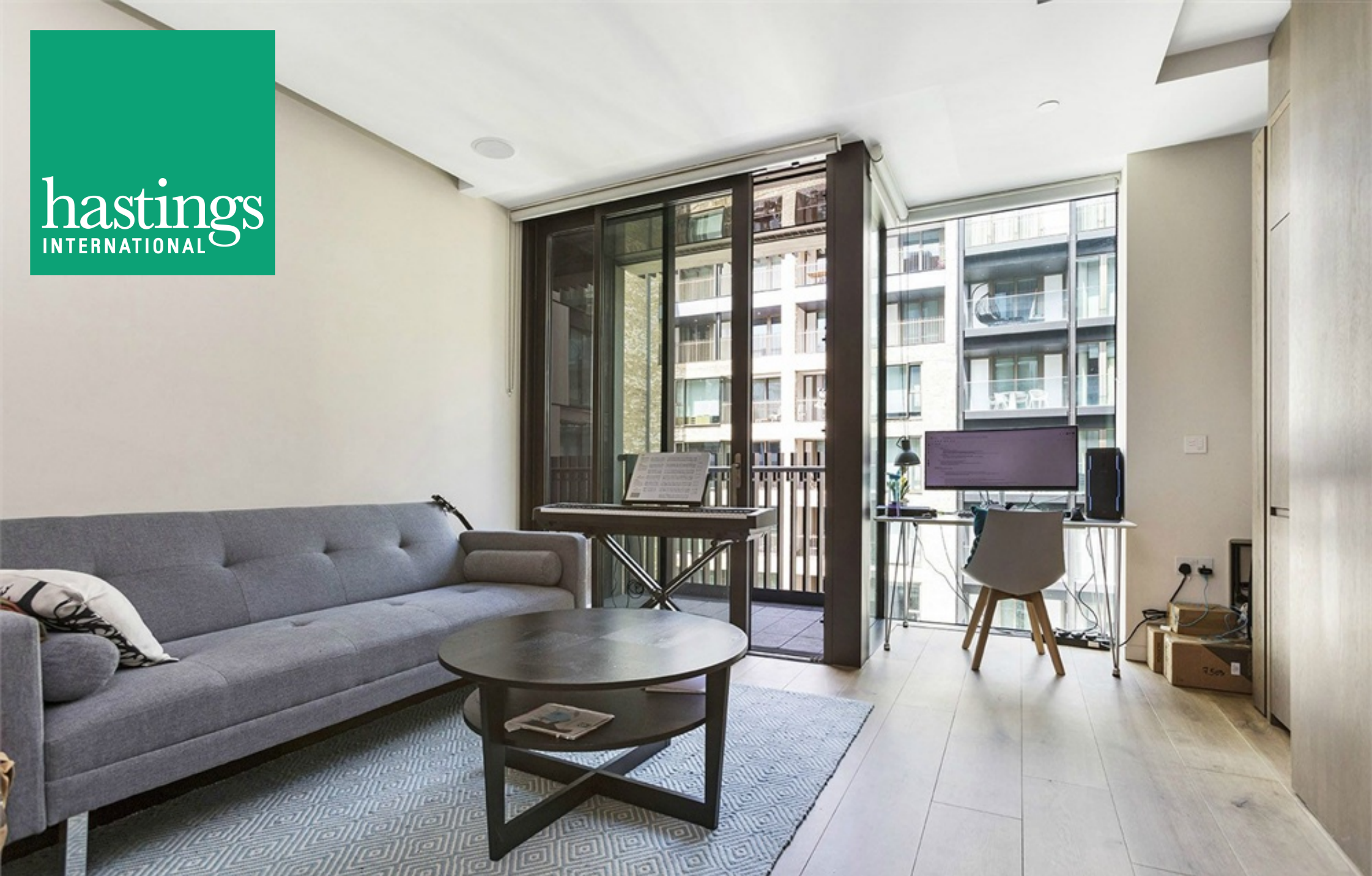
7 Pearson Square