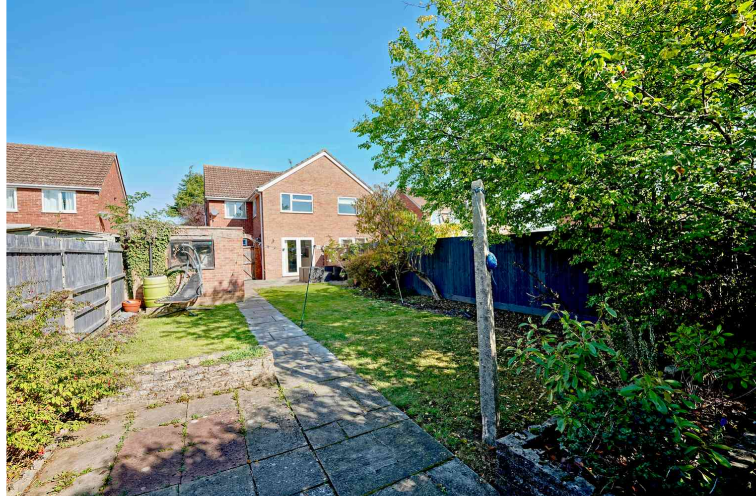
The Pound, St Ives PE27 3XQ