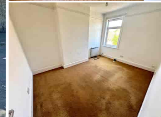
East Street, Huntingdon PE29 1WZ