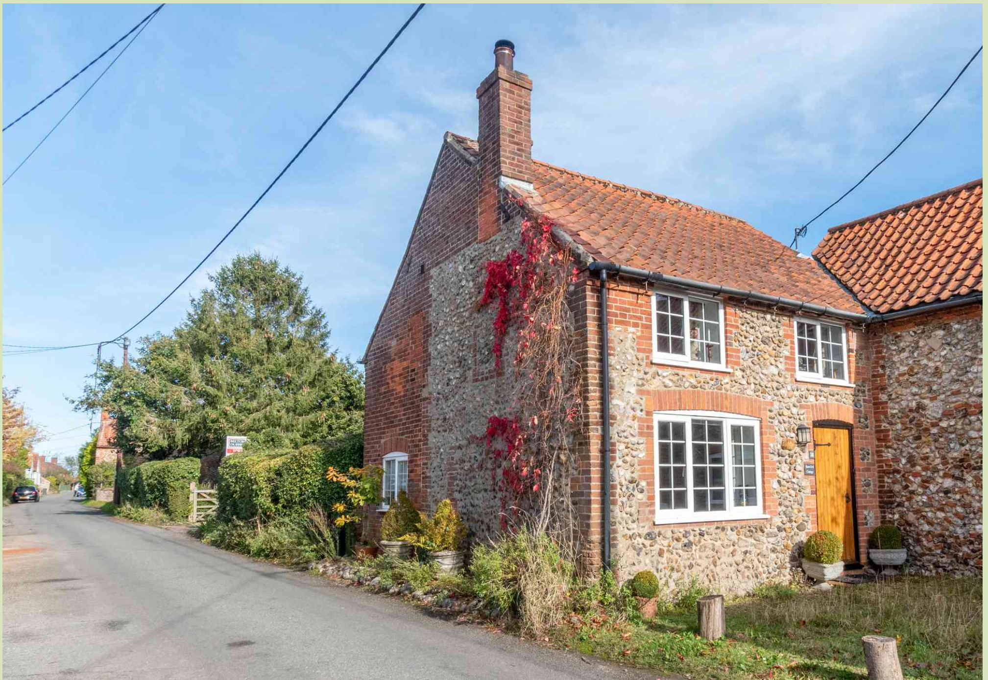
Barn Owl Cottage, Barney Guide Price £575,000