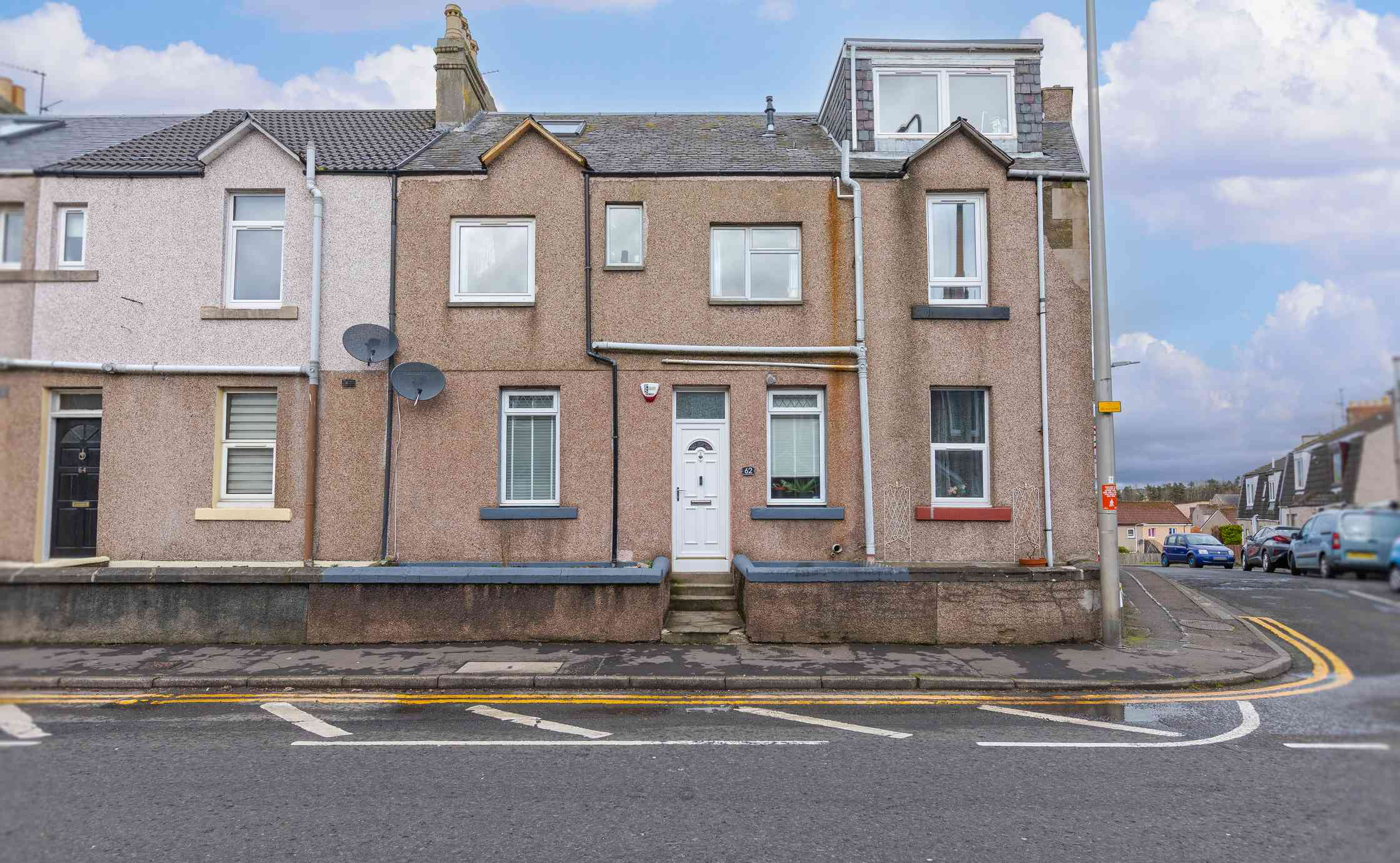
Offers Over £85,000 62 Dunfermline Road, Crossgates, Cowdenbeath, Fife, KY4 8AS