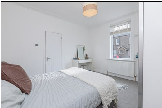
3.7m x 4.0m (12' 2" x 13' 1")