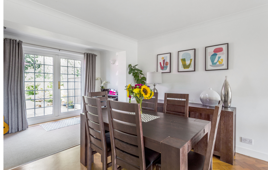
14 Orchard Road, Sevenoaks, Kent TN13 2DX £675,000 - Freehold