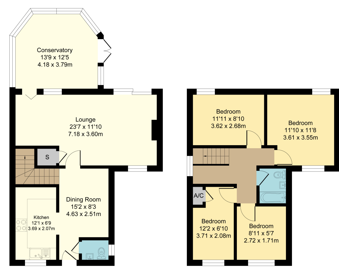
Total Area: 111.7 m<sup>2</sup> ... 1203 ft<sup>2</sup> All Measurements are approximate and for display purposes only

Area: 48.7 m<sup>2</sup> ... 524 ft<sup>2</sup>