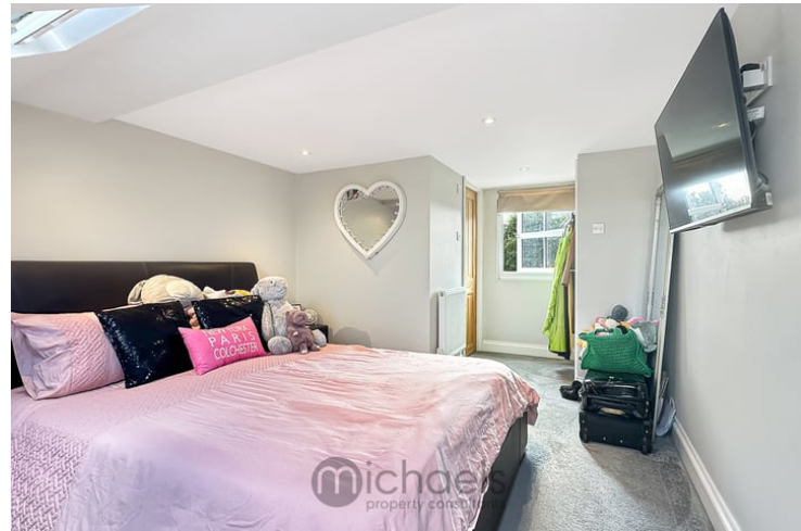
16' 6" x 13' 0" (5.03m x 3.96m) Inset spotlights, velux windows & window to rear aspect, fitted storage, radiator, access to: