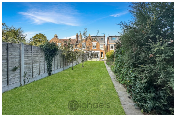
A striking and private enclosed rear garden is showcased and measures circa 100ft in length. The garden commences with a block paved patio area and offers itself as the ideal place for peaceful reflection and al-fresco dining. The remainder of the garden is predominately laid to lawn and features an array of mature hedges, shrubs and plants throughout. Positioned to the rear of the garden, is the added luxury of an outbuilding and could easily serve purposes such as a home gym, office or children's play room. Further garden storage is also on offer. A residents parking scheme is in place, with permits easily obtainable from the local council, with further visitors permits available.