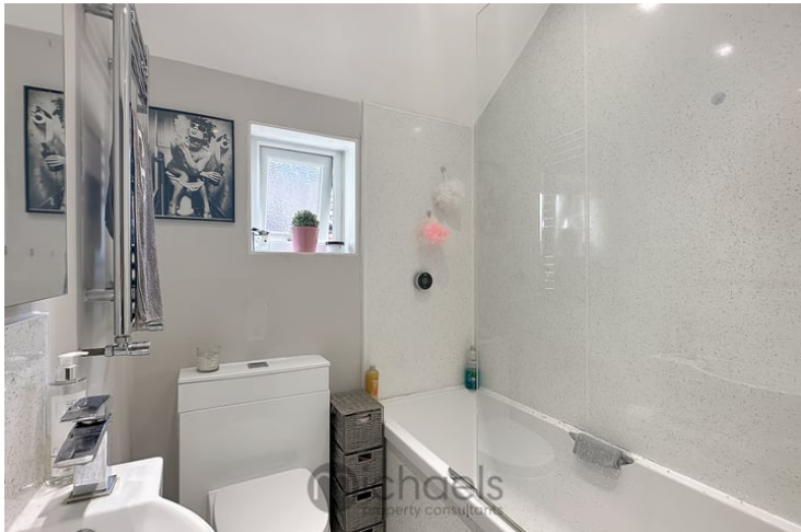
Panel bath with shower over and screen, W.C, wash hand basin, window to side aspect