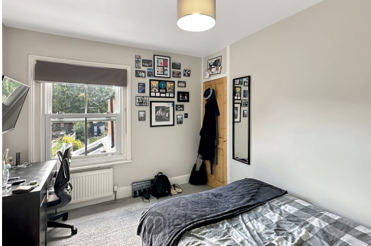
9' 3" x 11' 2" (2.82m x 3.40m) Window to rear aspect, radiator