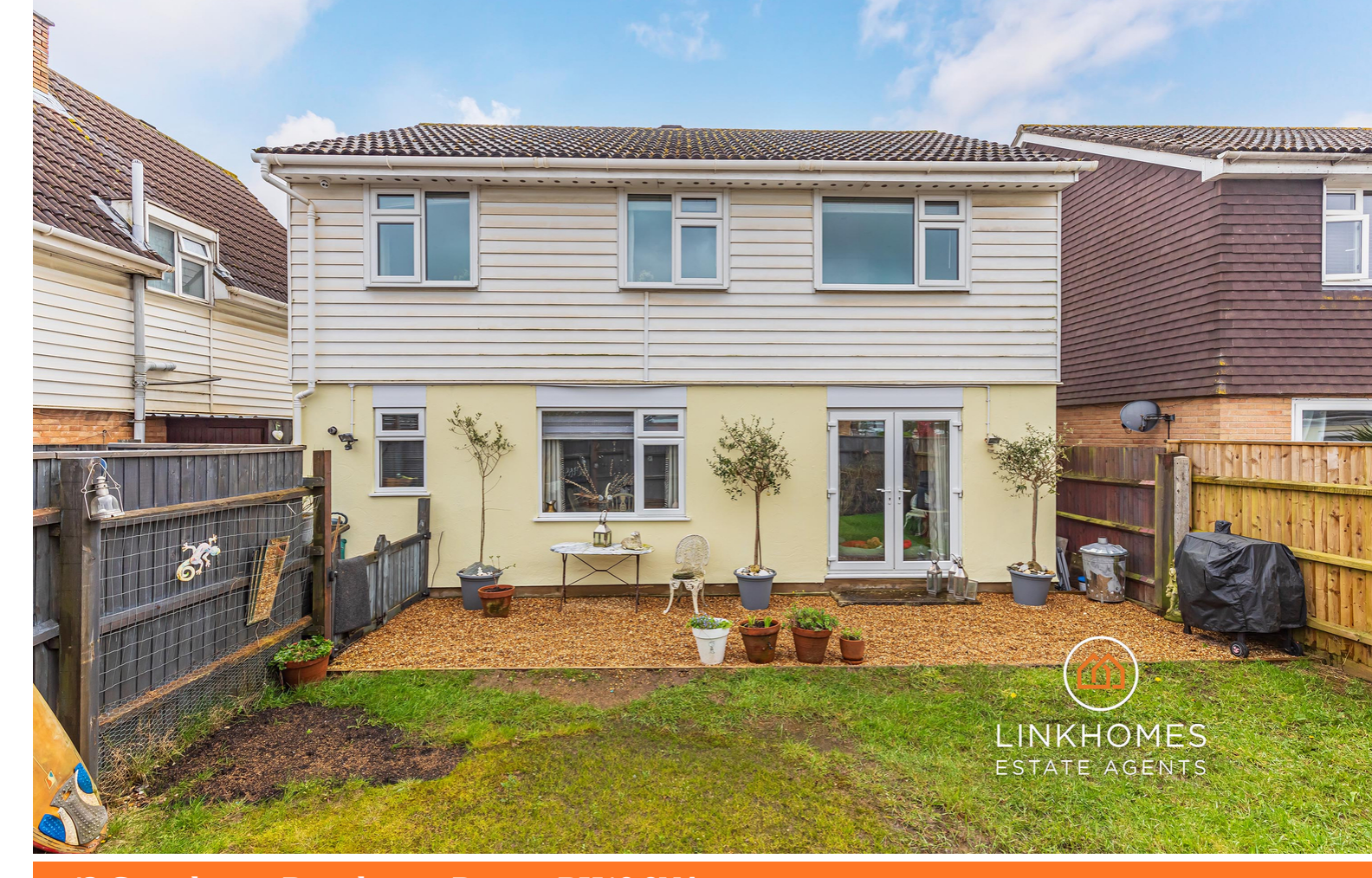
42 Greenhayes, Broadstone, Dorset, BH18 8NA Offers Over £450,000

** NO FORWARD CHAIN ** PERFECT FAMILY HOME ** Link Homes Estate Agents are delighted to present for sale this four bedroom, two bathroom detached house situated in the sought-after BH18 location. Benefitting from an array of standout features including four good-sized bedrooms with bedroom one offering a walk-in wardrobe, an open plan lounge/dining room with direct access onto the private garden, a separate kitchen with space for three under-counter appliances, a four-piece family bathroom suite, a separate utility room, a downstairs WC, a single garage and a tarmac driveway for multiple vehicles! This is a must-view property to appreciate the wealth of accommodation on offer!