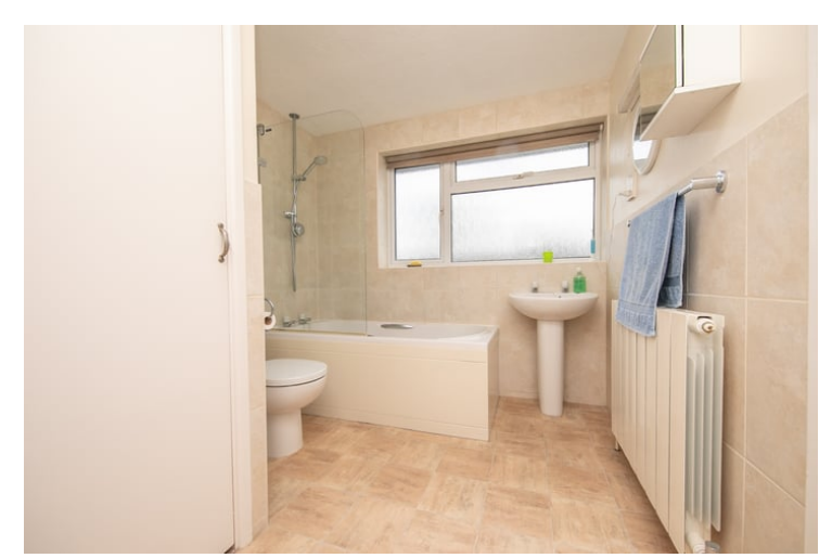
Double glazed obscure window to front, radiator, part tiled walls, low level WC, wash hand basin, bath with shower, airing cupboard with immersion heater.