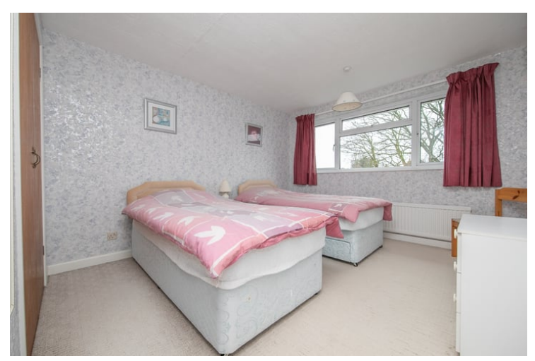
13' 0" \times 10' 10" (3.96m \times 3.30m)Double glazed window to rear, radiator, fitted wardrobe.