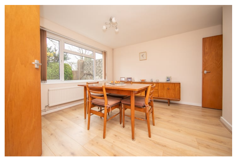
11' 5" x 10' 11" (3.48m x 3.33m) Double glazed window to rear, radiator, French doors opening onto the lounge.