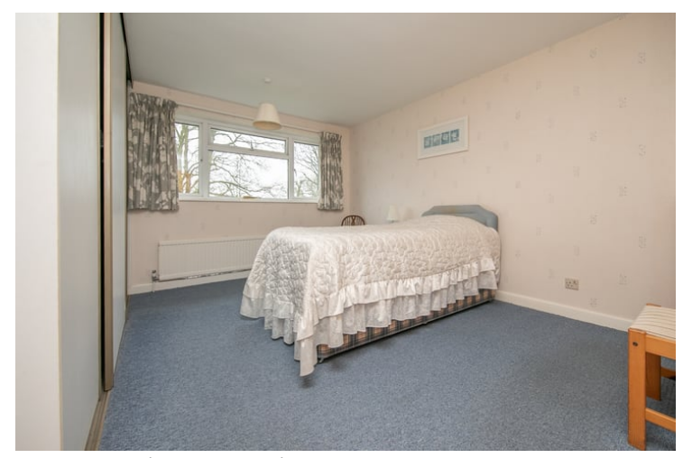
13' 4" x 11' 06" (4.06m x 3.51m) Double glazed window to rear, radiator, fitted wardrobe, door leading to: