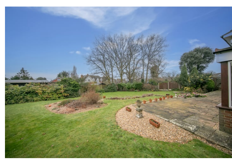
A generous established and well secluded mature garden mainly laid to lawn, with various trees, shrubs and plants, large patio area, side access to the garage and driveway.