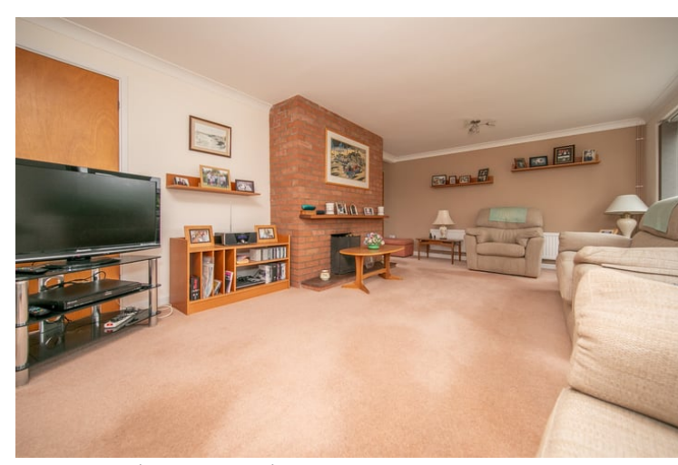
18'\ 2''\ x\ 13'\ 2'' (5.54m x 4.01m) Double glazed window to rear, patio doors to rear, two radiators, brick fireplace with tiled hearth.