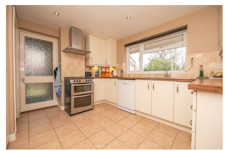
12' 0" x 10' 6" (3.66m x 3.20m) Double glazed window to front, radiator, inset spot lights, tiled floor, range of wall and base units, laminate worktops with concealed lighting over, cooker hood, stainless steel sink, integrated fridge/freezer, space for cooker and dish washer.