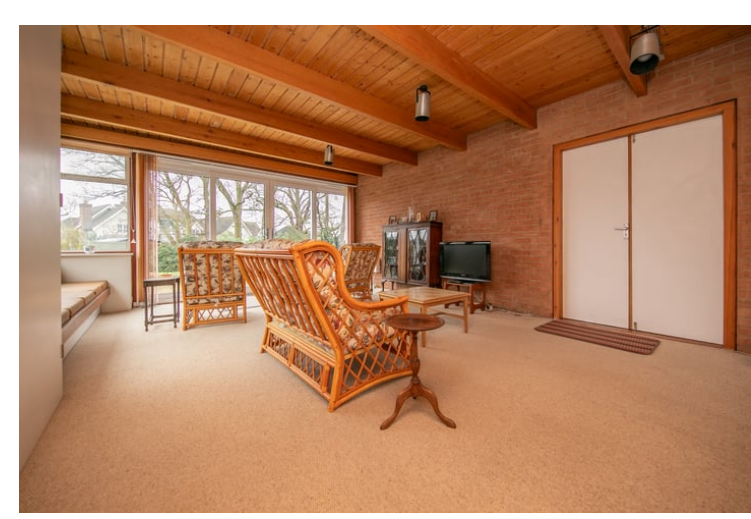
20'\,0'' \times 16'\,4'' (6.10m x 4.98m) Double glazed windows to side and rear, patio doors opening onto the garden, wall mounted electric heater, range of large built-in storage cupboards, fitted bench seats with storage under, concealed pelmet lighting.