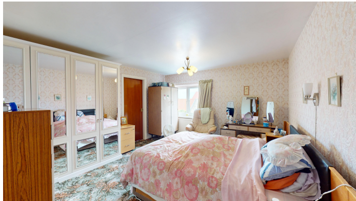
Master Bedroom With En Suite