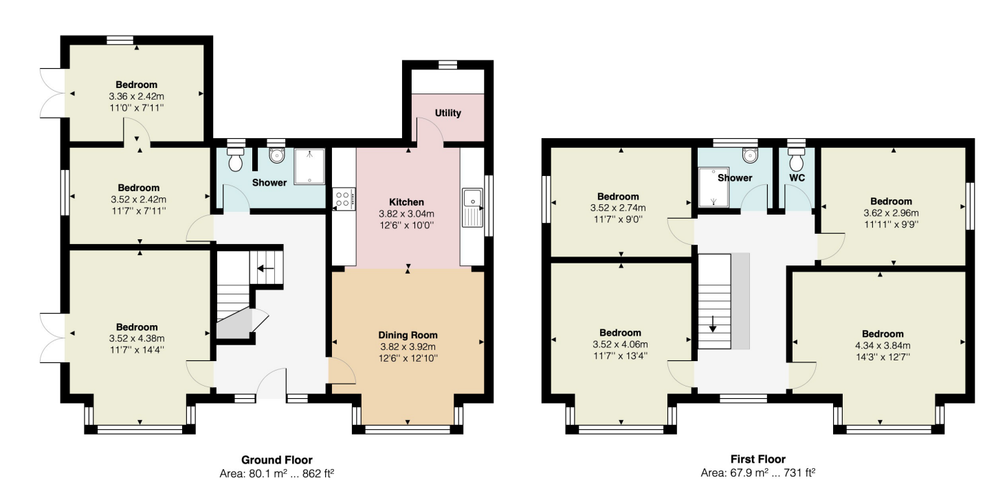
19, Powder Mill Lane, Southborough, Tunbridge Wells, TN4 0DD

Total\ Area:\ 148.0\ m^2\ ...\ 1593\ ft^2 All measurements are approximate and for display purposes only