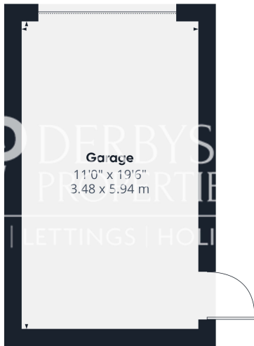
Ground Floor - Building 2