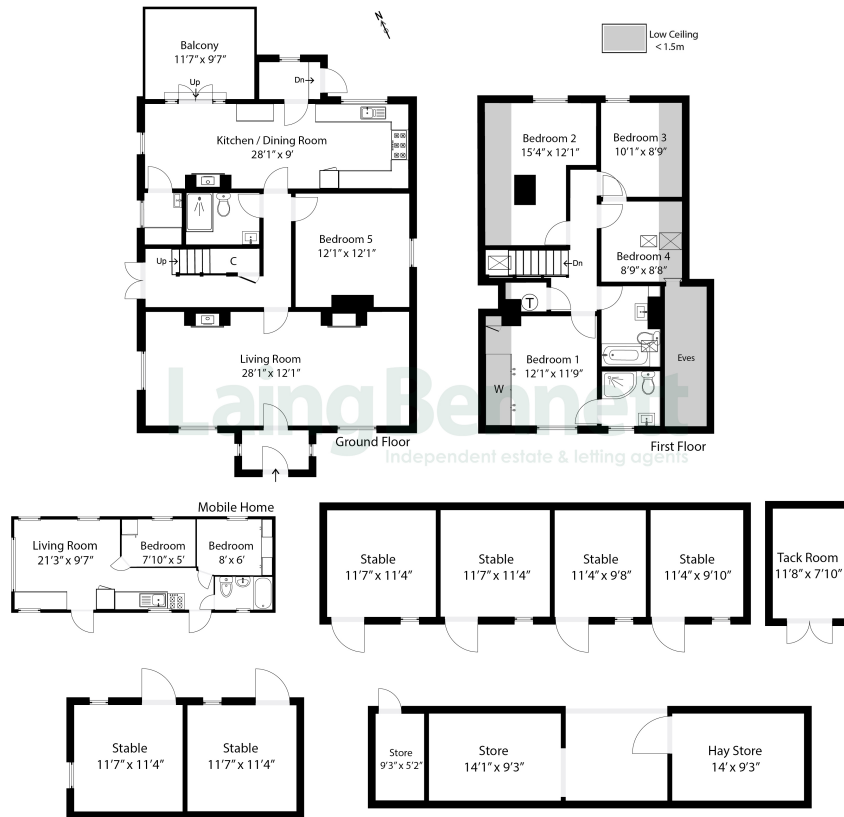
Illustration for Identification purposes only. Measurements are approximate. Dimensions given are between the widest points. Not to scale. Outbuildings are not shown in actual location.

Approximate Gross Internal Area (Excluding Balcony, Eves and Outbuildings) = 161 sq m / 1732 sq ft Mobile Home = 25 sq m / 265 sq ft Outbuildings = 120 sq m / 1287 sq ft