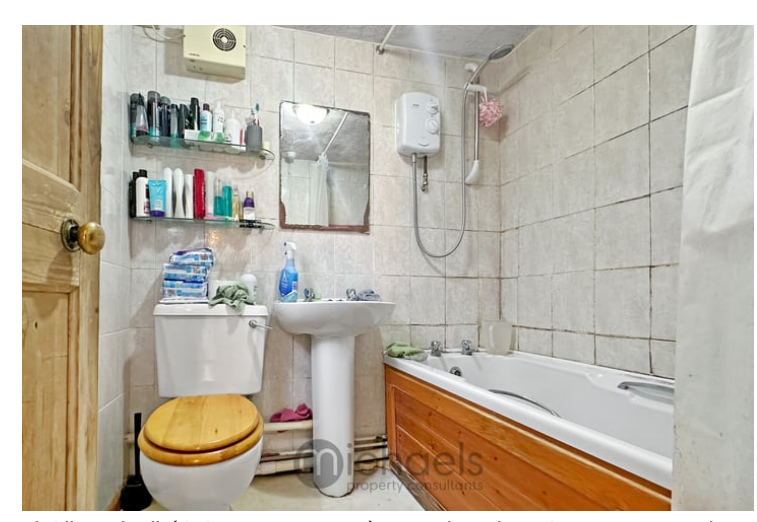
6' 9" x 5' 5" (2.06m x 1.65m) Low level W.C, vanity wash basin, bath with shower over, radiator, tiled walls.