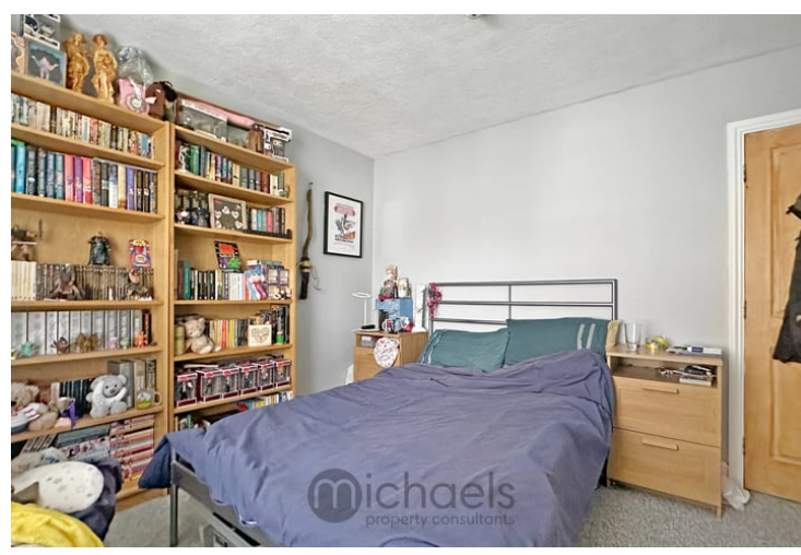
11' 7" x 10' 9" (3.53m x 3.28m) UPVC windows to front aspect, radiator.