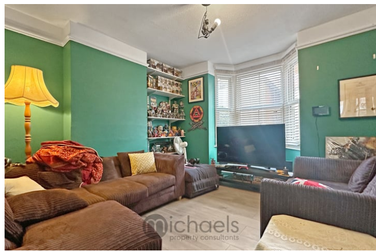
11' 7" x 10' 9" (3.53m x 3.28m) UPVC window to front aspect, radiator.