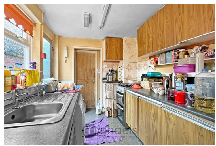
10'\ 0''\ x\ 7'\ 4''\ (3.05m\ x\ 2.24m) Range of base and eye level units, cupboards and work surfaces, UPVC window to side aspect, space for appliances, stainless steel sink/drainer, door leading to: