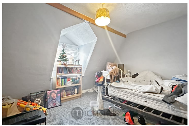
11' 8" \times 10' 5" (3.56m \times 3.17m) UPVC window to rear aspect, radiator.