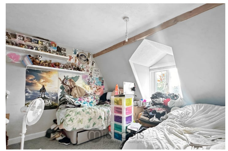
12' 5" \times 8' 7" (3.78m \times 2.62m) UPVC window to front aspect, radiator.