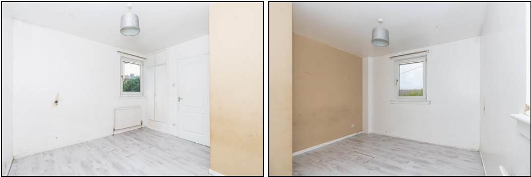
3.07m x 3.15m (10' 1" x 10' 4")