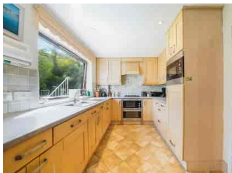
Harewood Road, South Croydon, Surrey, CR2 7AL