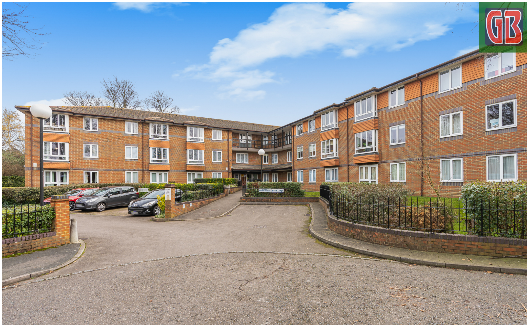
Flat 21 Beech Lodge, Farm Close, Staines-upon-Thames, Surrey. TW18 3EW. 1 Bedroom Retirement Property - £125,000 Leasehold