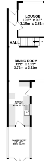
GROUND FLOOR 484 sq.ft. (45.0 sq.m.) approx.

Chatham is located within the Medway towns with good transfer links by rail into Central London and Ebbsfleet International plus road connections to the M2/M25 & M20. Amenities include a bustling Town Centre, the Historic Dockyard, Capstone Ski & Snowboard centre and nearby Gillingham FC and Rochester Castle & Cathedral.