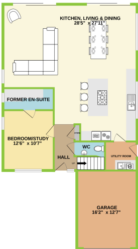
GROUND FLOOR 1164 sq.ft. approx.