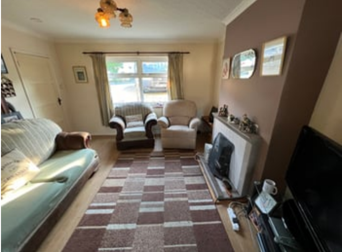
13' 1" \times 12' 5" (3.99m \times 3.78m) with open fire place and tiled surround, tiled hearth, double glazed window to front, central heating radiator, wood effect laminate flooring, TV point, door into -