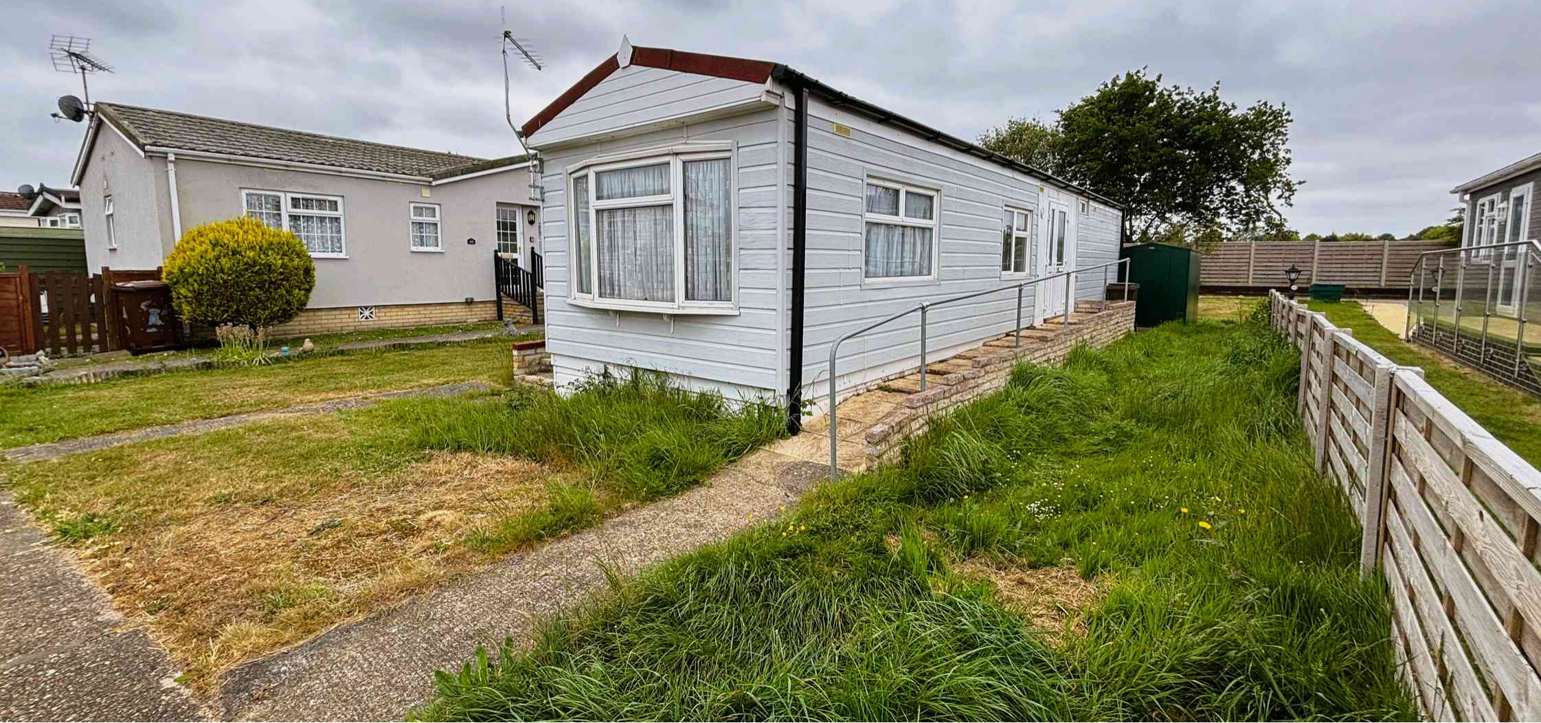
Two Bedroom Park Home Kingsmead Park, Rochester, Kent, ME3 9TA

Offers in Region of £80,000 Non-traditional