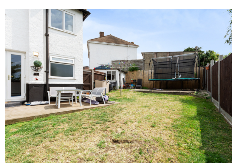
Guide Price £385,000 Mount Culver Avenue, Sidcup, Kent, DA14 5JW