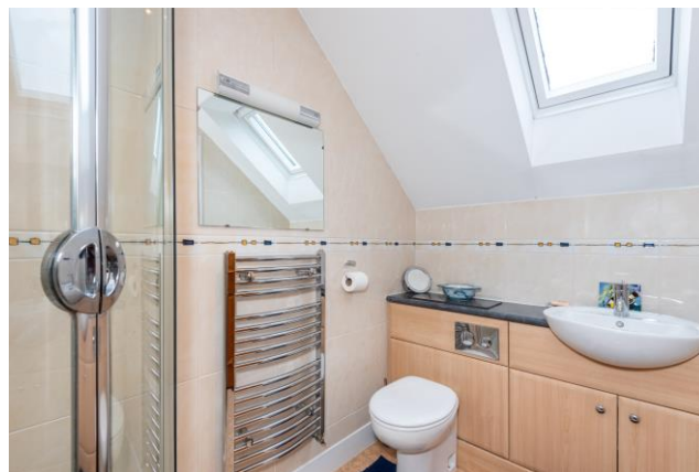
BEDROOM 3 & EN-SUITE

FAMILY BATHROOM (10'9 x 6') Three piece suite comprising shower above panelled bath, vanity unit wash hand basin and WC. Double glazed frosted window, fully tiled walls, tile effect flooring, heated towel rail and ceiling spotlights.