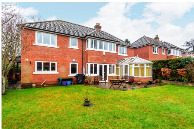
REAR OF THE PROPERTY

DOUBLE GARAGE Electric door, own power supply and a recently fitted combi boiler.