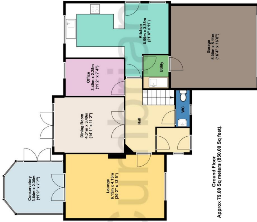
Ground Floor Approx 79.00 Sq meters (850.00 Sq feet).