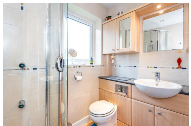
BEDROOM 1 & EN-SUITE

BEDROOM 2 (13'6 max x 12'8 max) Double glazed window to the rear with radiator below and loft access.