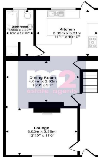
Ground Floor Approx 53 sq m / 571 sq ft