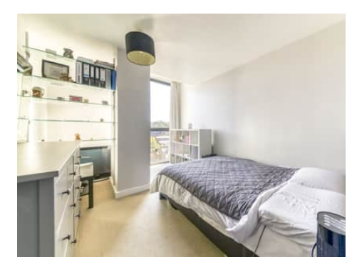
Centrillion Point, Masons Avenue, Croydon, Surrey, CR0