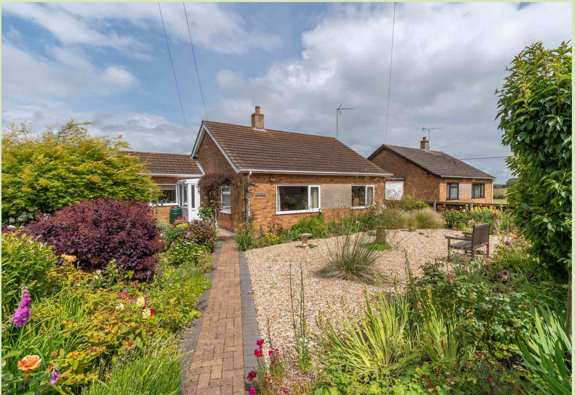
2 Green Close, Hempton Guide Price £330,000