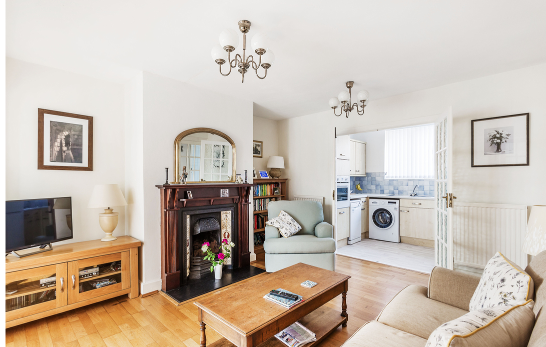
Pheasant Pluckers Cottage, Hever Castle, Hever, Edenbridge, Kent TN8 7NB £699,950 - Freehold