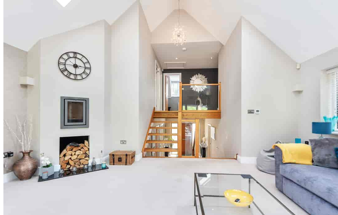
28 Marlow Bottom, Marlow, Buckinghamshire SL7 3LY Guide Price £1,295,000 - Freehold