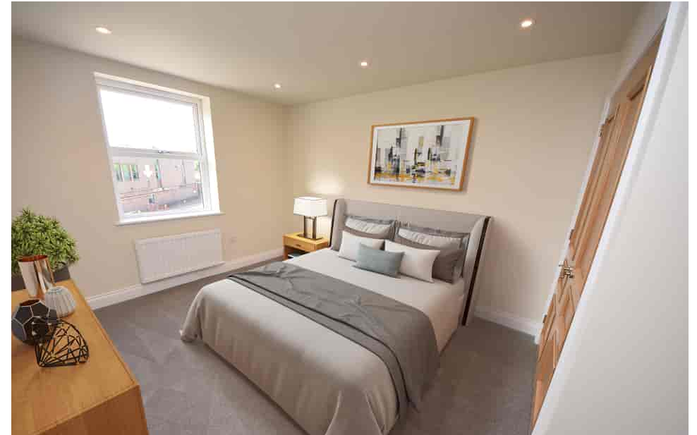
7 The Old Elephant & Castle, Causeway, Banbury, Oxfordshire. OX16 4SN Guide Price £247,000 - Share of Freehold