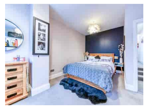
Campden Road, South Croydon, Surrey, CR2 7EN