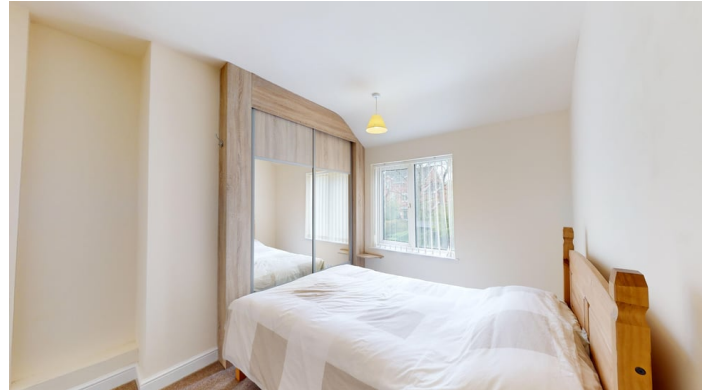
Bedroom two can be found to the rear of the property and is of double proportions and benefits from fitted wardrobes.