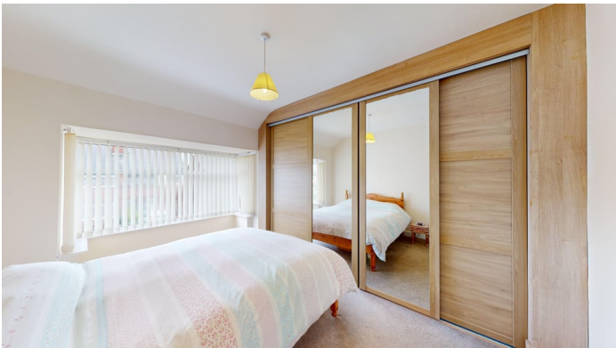
Bedroom one is located to the front of the property is of double proportions and benefits from having spacious fitted wardrobes running the length of the bedroom.