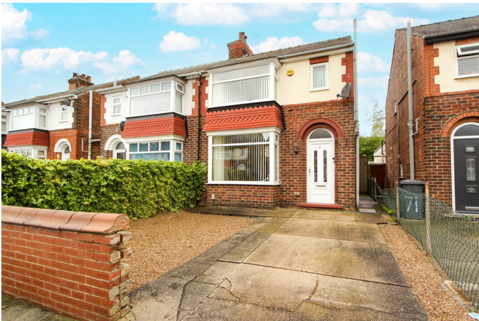
The front has a spacious driveway allowing for off road parking.