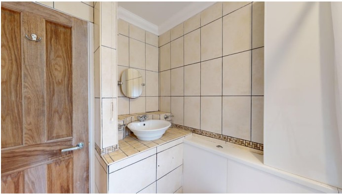
Comprising of a bath with overhead shower, wash hand basin and w/c.