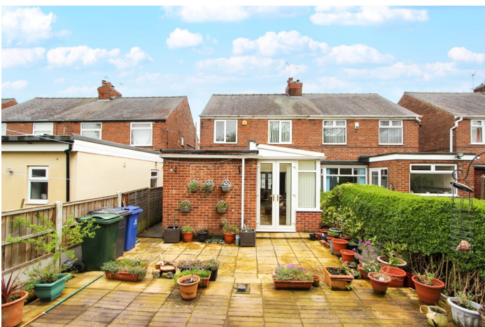
The paved rear enclosed garden features a spacious Summer house which would be ideal for a home office or Gym.