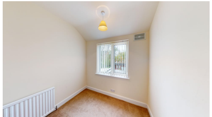
Bedroom three can be found to the rear of the property.