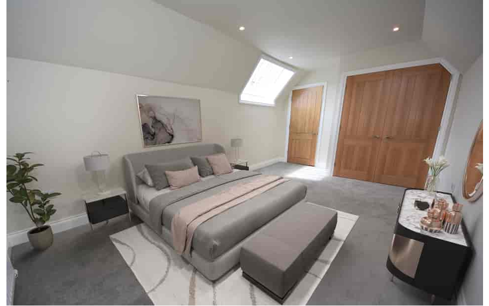
2 The Old Elephant & Castle, Causeway, Banbury, Oxfordshire. OX16 4SN Guide Price £265,000 - Freehold