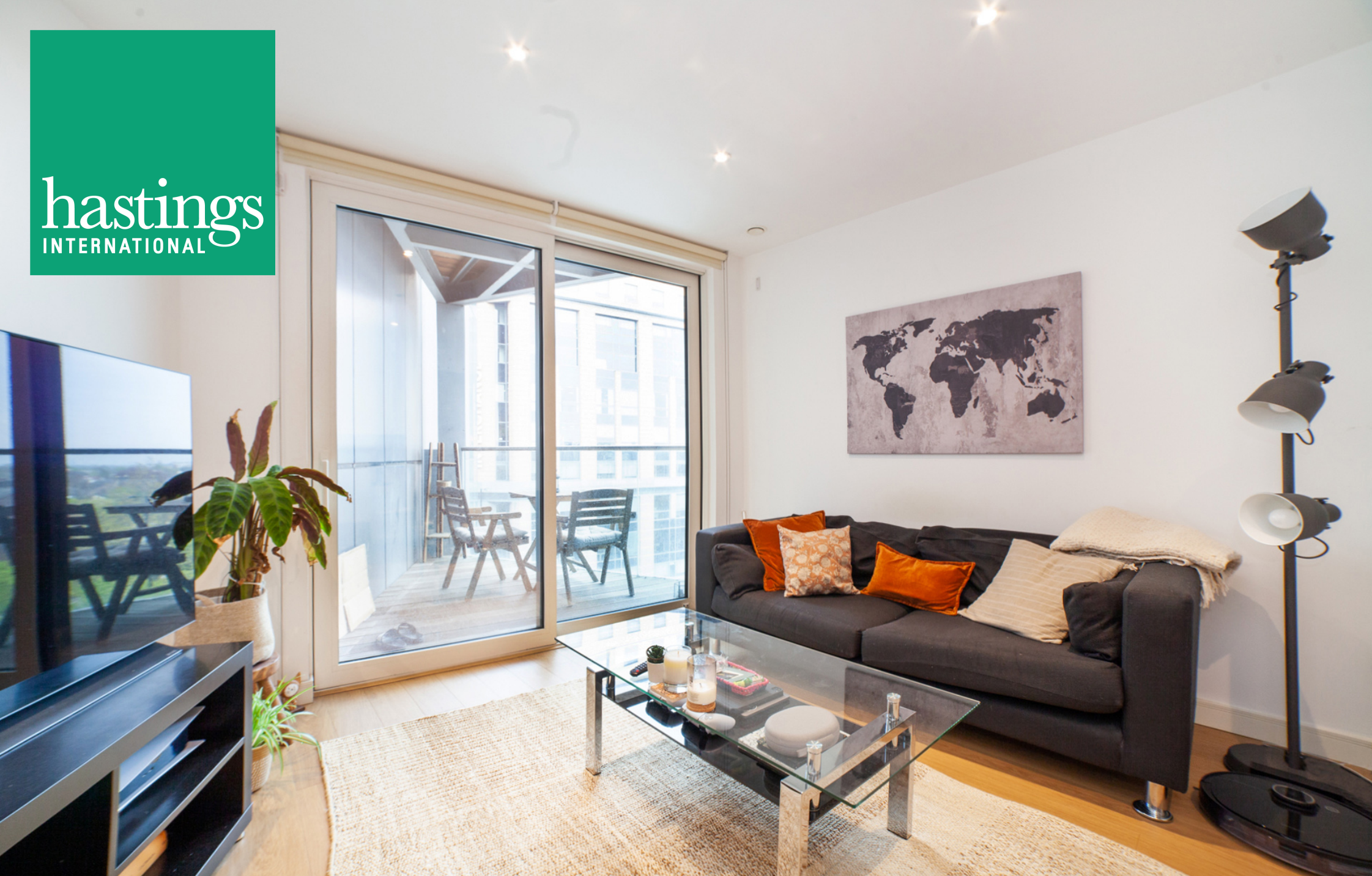
3 Saffron Central Square