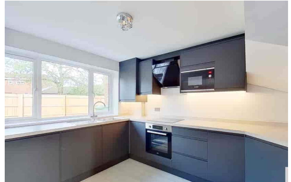
Elderbek Close, Cheshunt, Hertfordshire EN7 6HT £490,000 - Freehold