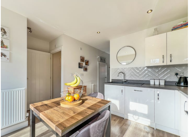
3.15m x 2.97m (10' 4" x 9' 9")