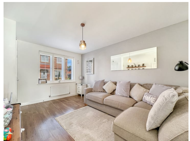
4.29m x 3.18m (14' 1" x 10' 5")