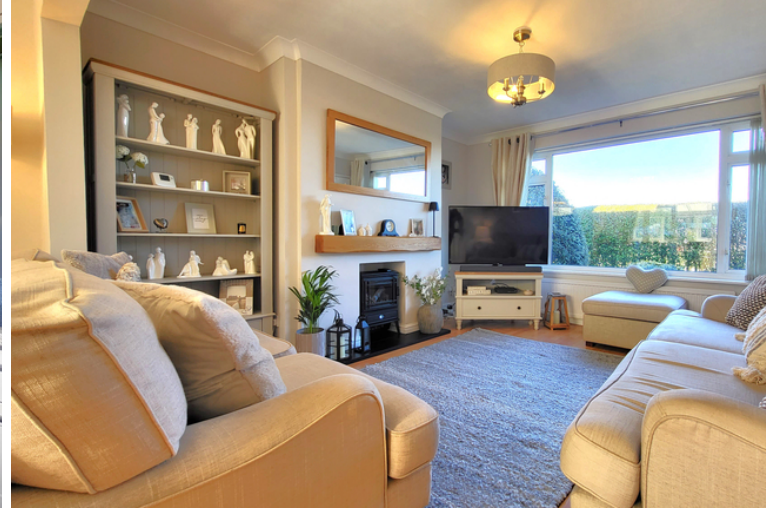
*** 4 DOUBLE BEDROOMS *** " Located by playing fields, this immaculately presented 4 bedroom chalet home has been modernised and updated to a high standard throughout. The ground floor of the home briefly comprises of an entrance hall, lounge which is open to the dining area, conservatory, kitchen, WC and bedroom 4. Upstairs, houses 3 further double bedrooms with an en-suite to bedroom one, and a family bathroom. The garden is a generous size. There is also a garage at the rear of the property with a parking space. EPC Energy Rating - D/ Council Tax Band - C"